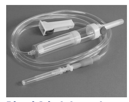
Blood Administration Set