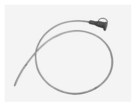
Infant Feeding Tube