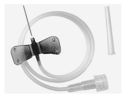
Scalp Vein Sets