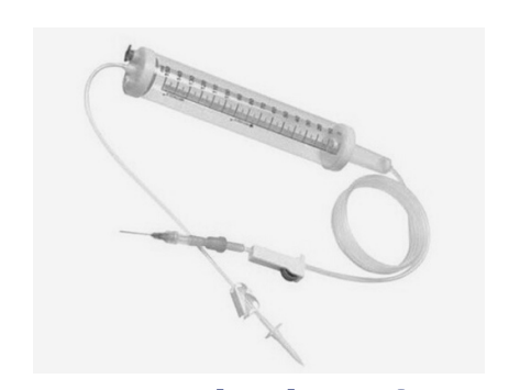
Measured Volume Set