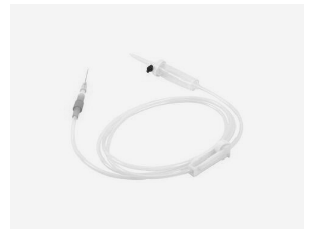
Infusion Set With Built in Air Vent